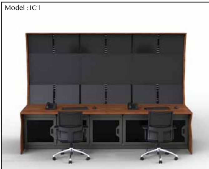
Model : IC1