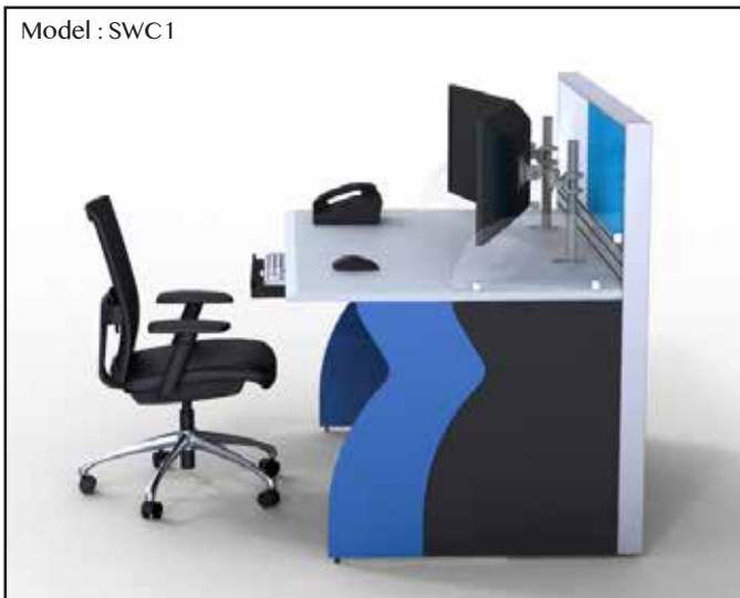
Model : SWC1