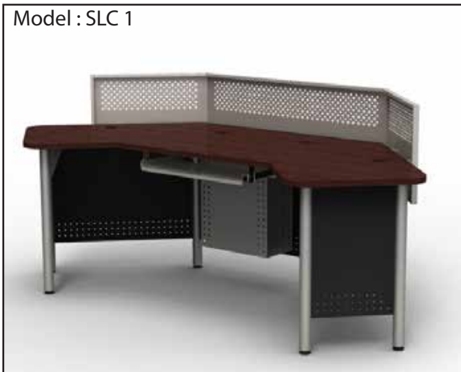
Model : SLC 1