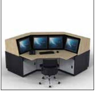
Rack Mount Console