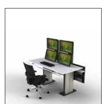
On Board Console