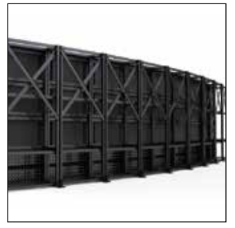
Video-wall - Bezel Less