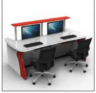
Recessed Console - Classic