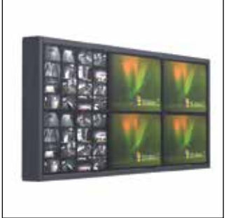
Video-wall - Bezel Type