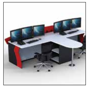
Low Profile Console